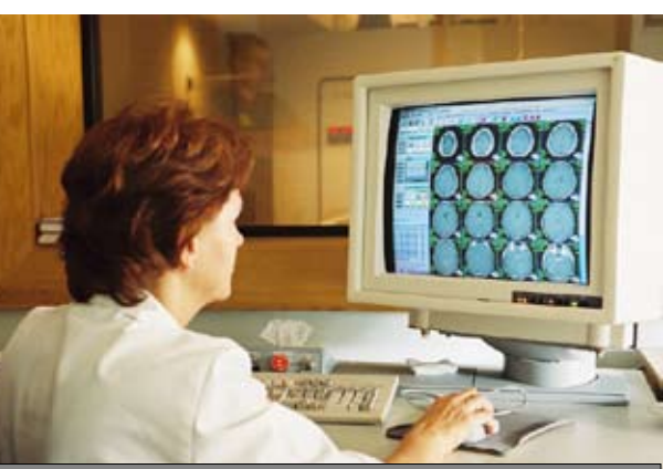
Telemedicine is one potential use for the new fibre optic system.

<የበ-₀° σታ∙ዉ ΓርጋΓርዉ የΓ ΓርጋΓርዉ ~σታα ÞL ÞΓ ব<በታ∙Δ'*